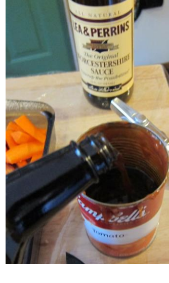
Next take empty can & fill half way