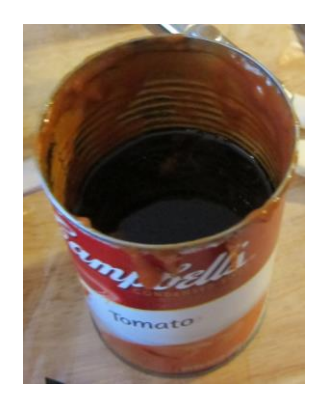
with Warcestershire sauce.