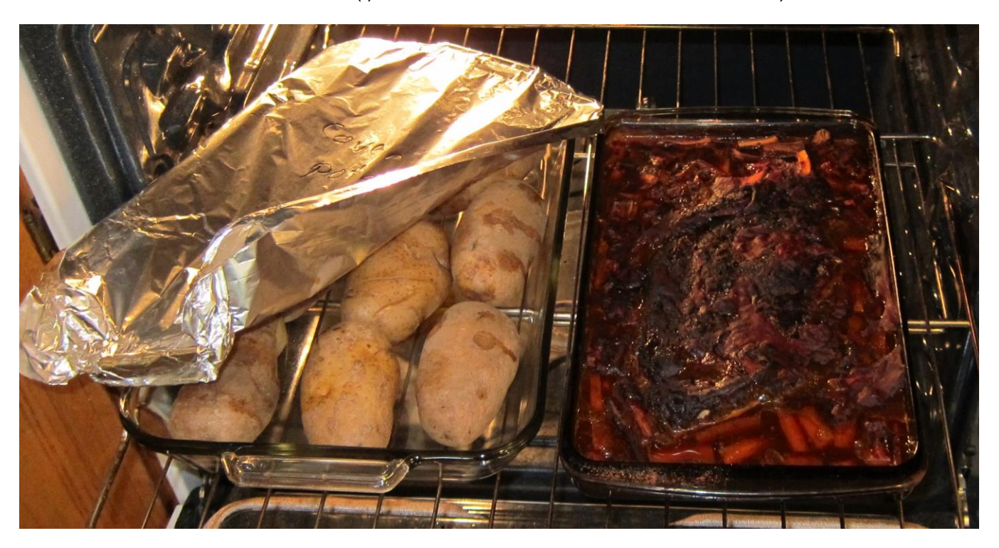
When done it looks like this!