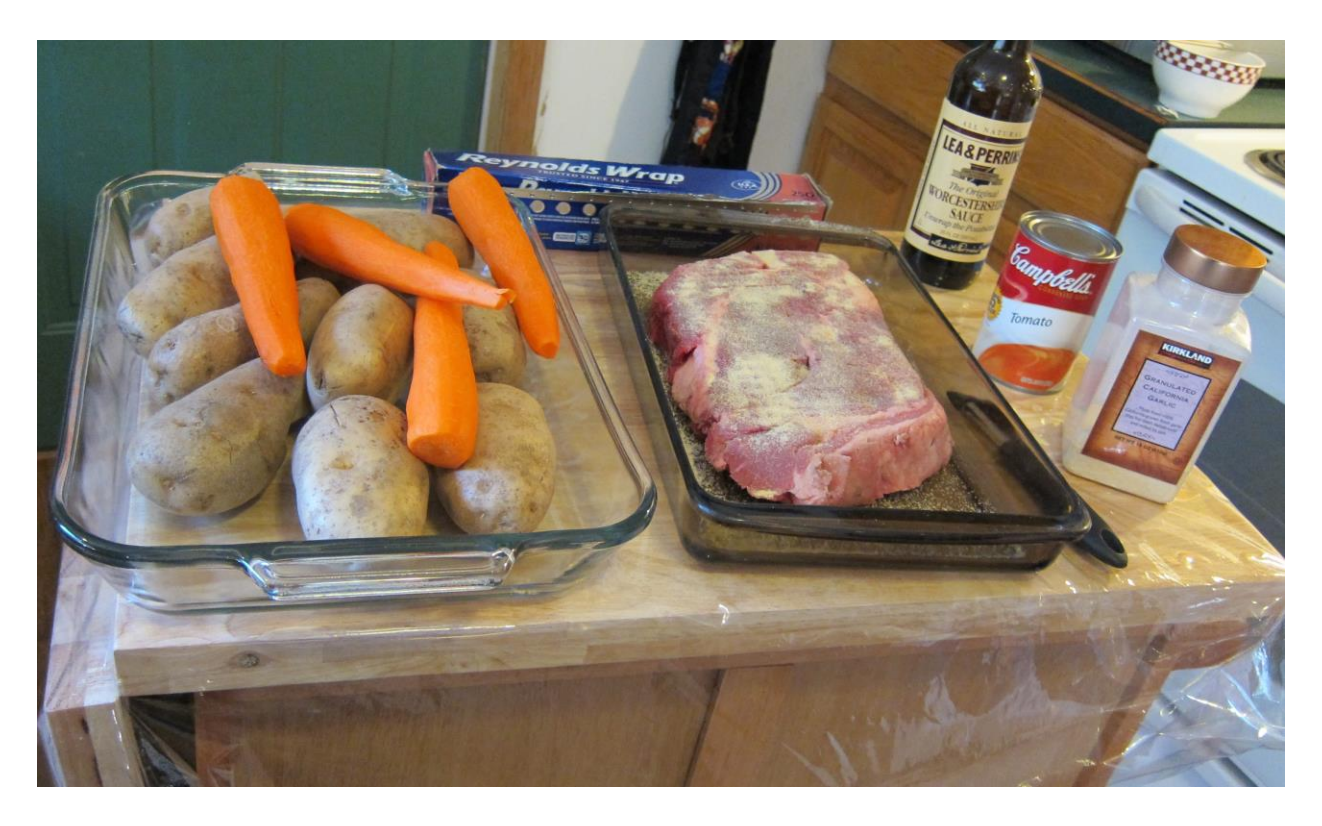
Ingredients: Potatoes, carrots, chuck roast, Worcestershire sauce, garlic powder, tomato soup or paste, water. You will also need foil.