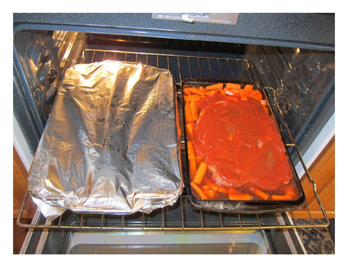
Put in oven set for 350 (f) & cook for 3 hours. Leave meat uncovered.)