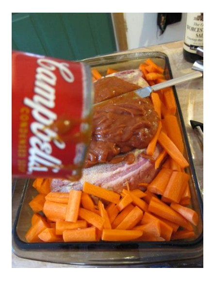
Cover meat with can of tomato soup or paste.